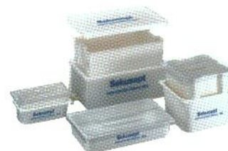
The Sekusept® - tray system for instrument preparation

PerOxyBalance® disinfectants offer the perfect balance of material compatibility, highly effective disinfection with low exposure times and high application safety.